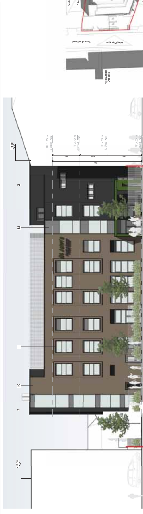
No. 34 Clarendon Road Proposed West Elevation. 1 : 100