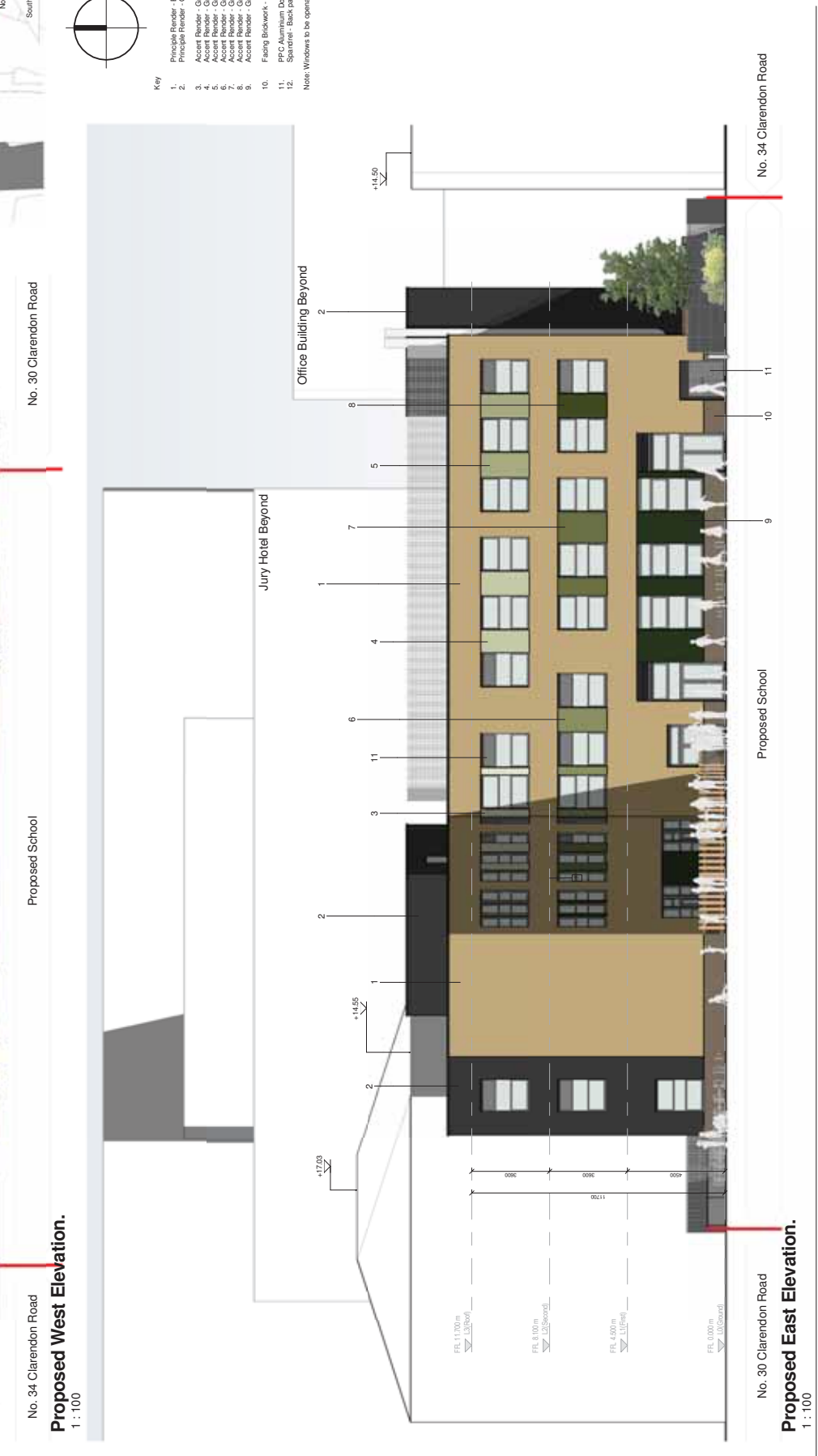
No. 30 Clarendon Road Proposed East Elevation. 1 : 100